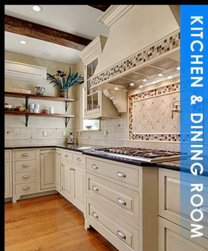
KITCHEN & DINING ROOM

Remove all clutter, including tissue boxes, remote controls, and as many personal photos and items as possible. Floors should be swept and carpets vacuumed. If large area rugs cover beautiful flooring, remove the rugs. Also, hide all children's toys and portable cribs.